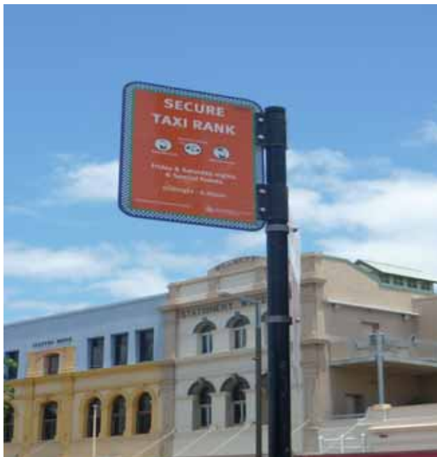
Figure 2: Secure taxi rank in Flinders Street East